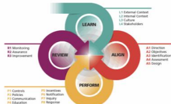
Figure 2-3 OCEG GRC Capability Model. Copyright ©2015. OCEG. Permission by OCEG is required for reproduction and/or use of materials.